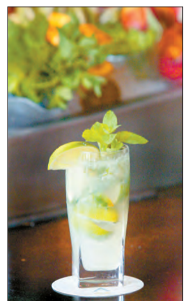
An authentic Cuban mojito.

Cuban mojito (Serves 1) This makes the perfect mojito — a little more time-consuming than other recipes, but delicious.