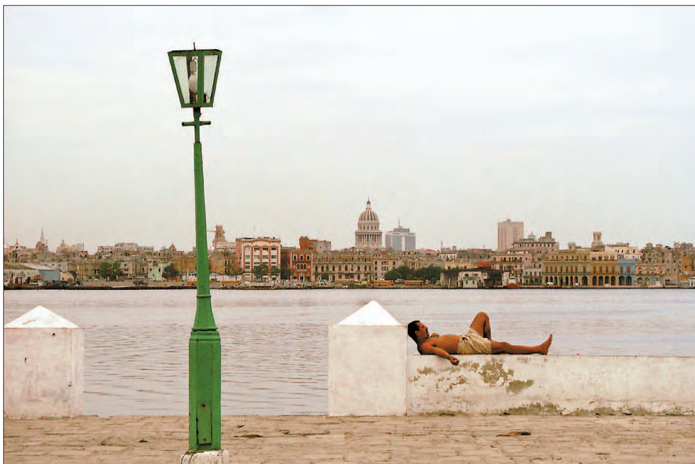
A man relaxes on the seawall overlooking Boca de Colimar in Havana.

Culinary adventures in an isolated land — inside the beautiful colonial city of Old Havana