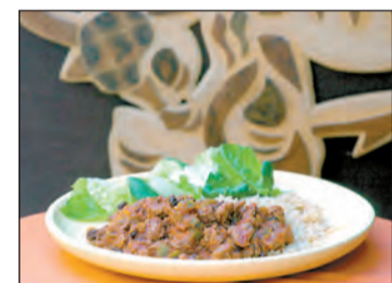
Cuban picadillo with brown rice and a side salad.

The people we met in Havana were warm, welcoming and proud. We left the city looking forward to meeting the